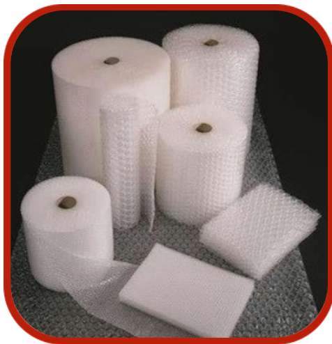
AIR BUBBLE FILM ROLLS

We are proud to be one of the leading manufactures of Air Bubble Roll in India. To assure the highest standards of quality we only use the finest grade of imported raw material available with the latest state of the art infrastructure and experienced workforce. To fulfill the needs of our valued customers our Air Bubble is available in standard roll form as well as customizable fabricated form.