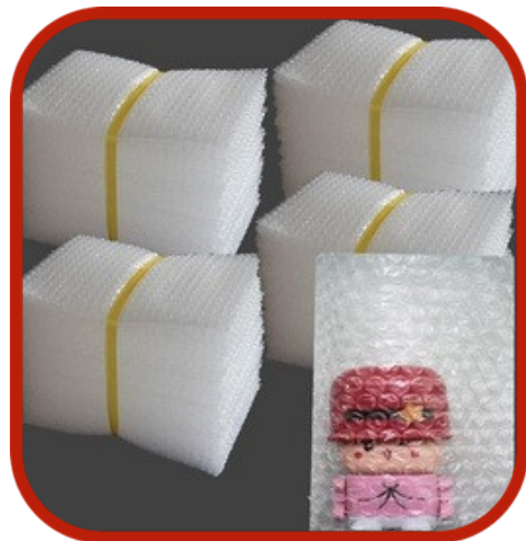
AIR BUBBLE POUCHES