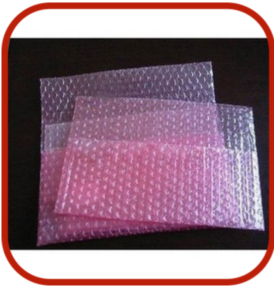
ANTI STATIC BAG PINK COLOUR

Protecting sensitive electronic components during shipping or storage is a top priority. We manufacture Anti Static Bag Pink Color as well as EPE Fitments that are specially designed to protect electronic items from static discharge, dust, and moisture. Our products are made from top-quality materials to provide excellent protection against ESD (Electrostatic Discharge) and are available in different sizes and dimensions to meet your specific packaging needs.