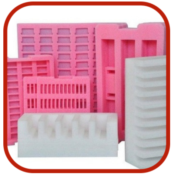
EPE FOAM ANTISTATIC